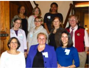
New Members at Winter Reception 2016

Please join WNDC officers, Board members, and other members to enjoy refreshments and a complimentary soft drink, wine, or cocktail. Learn about opportunities to take part in the work and fun of WNDC. All new members who joined since November 2016 are especially invited to get to know WNDC members and to learn more about the Club. Guests are also welcomed.