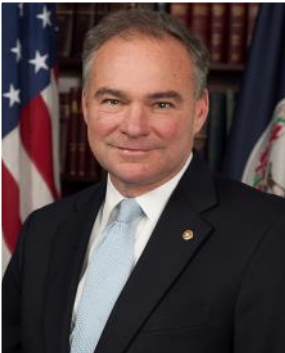
Democratic Vice-Presidential Candidate Tim Kaine

Join Democratic friends and allies as we cheer and watch Tim Kaine on the WNDC big screen in the sole Vice—Presidential Debate in Farmville, Virginia, at Longwood University. Event includes debate preview with surprise special guests. WNDC Bingo cards will be available to use during the debate, and prizes will be awarded.